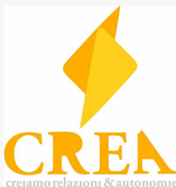
Associazione CReA Centro Ricerche e Attivita